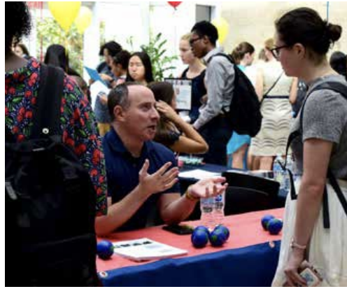
Students speaking with campus partners at the Penn Abroad Fair