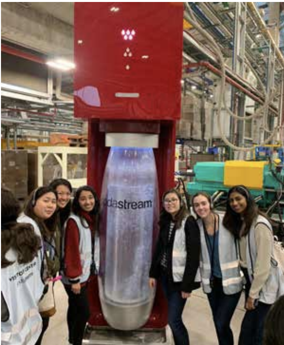
Operations Strategy Practicum, Israel, Fall 2019