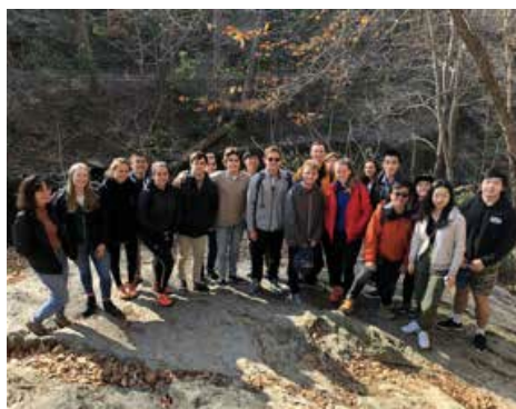
Fall 2019 excursion to Wissahickon Park

Newly rebranded in 2019, Exchange at Penn (EAP) allows undergraduate students from partner institutions worldwide to attend Penn for a semester or year-long exchange to experience Penn's unique academic culture and co-curricular opportunities. During the 2019-2020 academic year, Penn Abroad welcomed its largest cohort of international exchange students to date, with 231 students hailing from over 51 partner institutions to pursue coursework across Penn's four undergraduate schools.