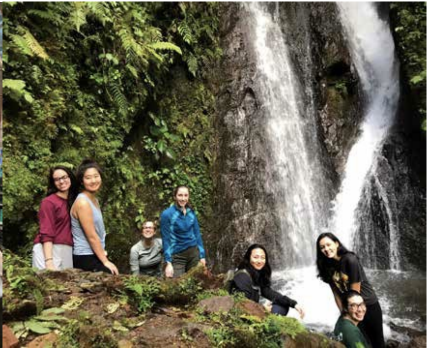
Field Studies in Tropical Biodiversity and Conservation, Costa Rica, Fall 2019