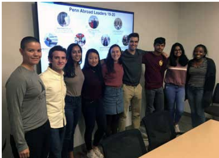
The Penn Abroad Leaders during their Fall 2019 planning retreat

The Penn Abroad Leaders (PALs) are a subset of Ambassadors, selected through a competitive application process,